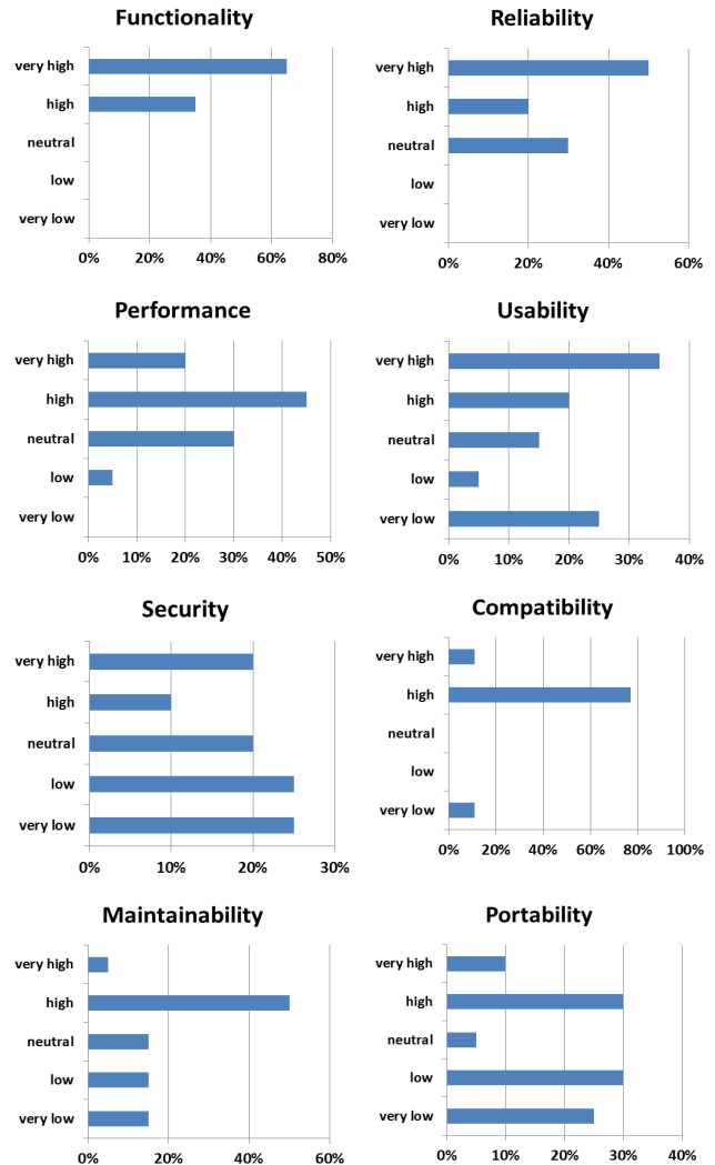
Fig. 2. Importance of Quality Attributes

quality attribute is considered more important if the most frequent answers are concentrated in ‘high’ and ‘very high’ scales. For example, functional suitability is considered of great importance since there was no component for which its importance was characterized as ‘neutral’, ‘low’, or ‘very low’. On the other hand, security and portability have been characterized as ‘low’ or ‘very low’ importance for approximately 50-55% of the investigated components.